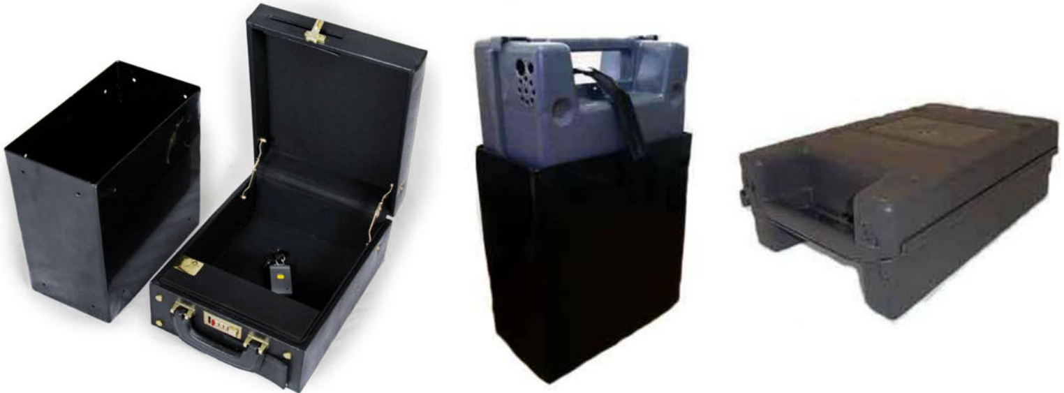
Small Cash Caddy -Leatherette